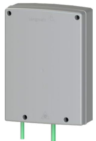
▲ EK770 ONT L Closed