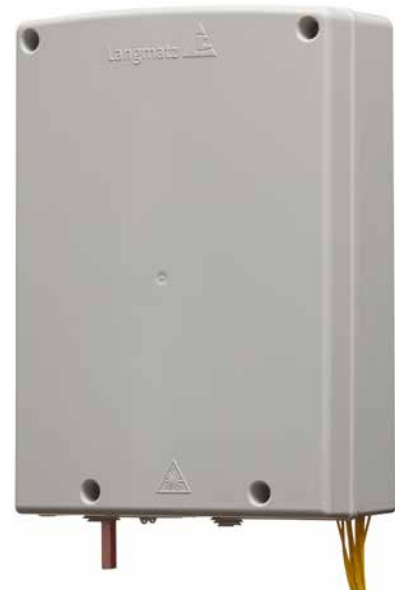
▲ ONT L 3.0 closed