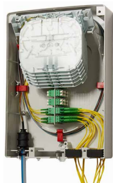
▲ ONT L 3.0 open