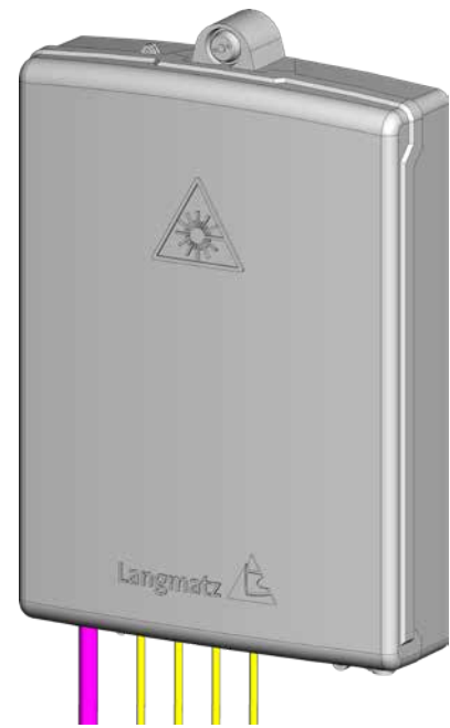
▲ ONT size M closed