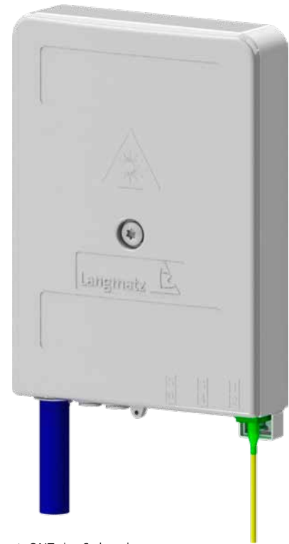
▲ ONT size S closed