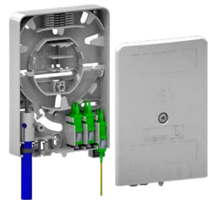
▲ ONT size S interior view