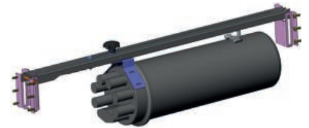
Swivelling telescopic fibre closure bracket Attachment to the manhole wall