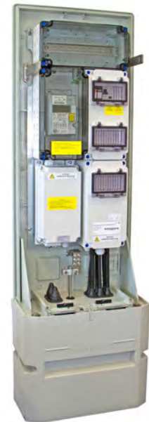
Example application: Power Supply Unit SVE 6 Z 259R installed in the energy terminal interface pillar EK 430