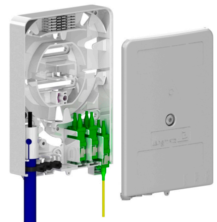
Mini OFD-STB interior