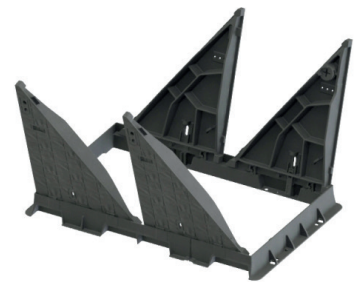
Triangular hinged cover EK 428 opened