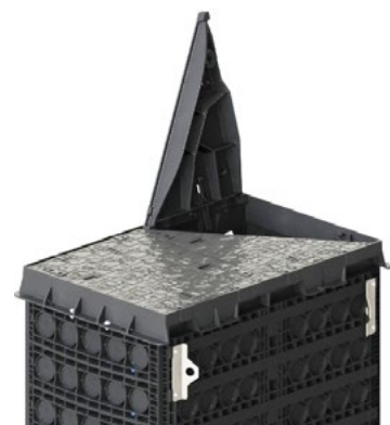
Triangular hinged cover EK 428 on an example manhole; 1 cover opened