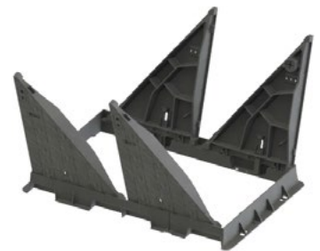
Triangular hinged cover EK 428 opened