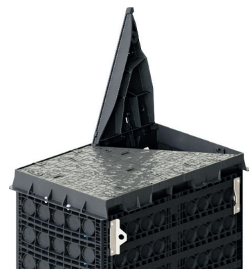
Triangular hinged cover EK 428 on an example manhole; 1 cover opened