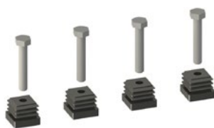
Accessories kit for optional height adjustment - 4x M8x45 hex screw - 4x plastic plug with M8 thread